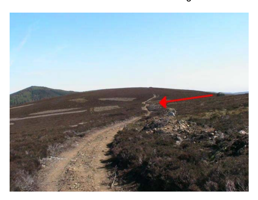
Fig. 4 – Photo taken in a south eastern direction showing the Hut in relation to the existing track. The red arrow shows the direction and relocation site of the hut.