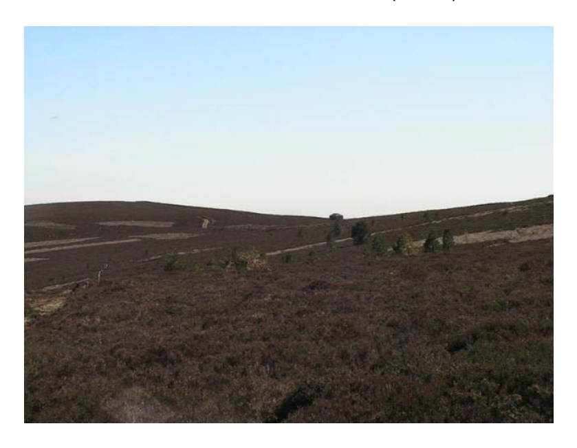
Fig. 2 – Photo taken in a southern direction showing the Hut in relation to the surrounding area. The Hut is visible between the hill's two peaks.

1. Retrospective planning permission is being sought for the retention of a Lunch Hut at Auld Cummerton in Strathdon. The purpose of the Hut is for traditional upland sporting activities and it is to be used as a retreat in the event of adverse weather conditions (FIG 2).